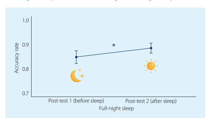
Figure 3. Word-recall Accuracy Changes Before and After Full-Night Sleep (Older Adults, Longer Training Group)

We conducted the same analysis on accuracy change in the two post-tests for the longer training group to examine whether older adults would successfully consolidate novel words after lengthened training. The model yielded the main effect of Post-test, suggesting that the accuracy in Post-test 2 was higher than in Post-test 1 ( p -value < .05, see Figure 3). It indicates the duration of training in word learning impacts memory consolidation. Longer training for older adults produced similar levels of word recall when compared to younger adults. These findings suggest that older adults may show an age-related decline in the memory process, but their memory could be better preserved if they were provided more opportunities for learning.